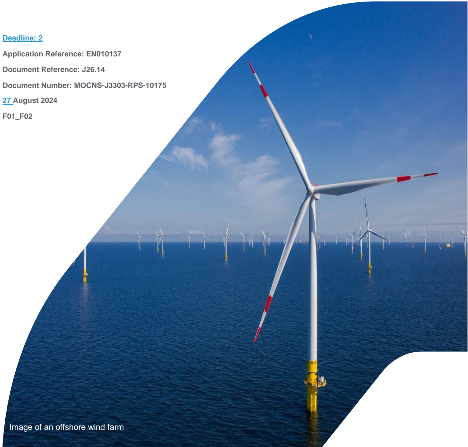
Image of an offshore wind farm